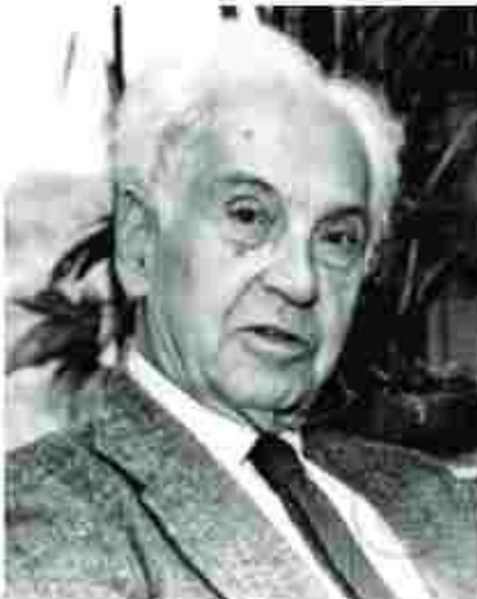
Ernst Mayr (1904 – 2004)

Born on 5 July 1904, in Kempten, Germany, ERNST MAYR , the Harvard University evolutionary biologist who has been called 'The Darwin of the 20 th century', was one of the 100 greatest scientists of all time. Mayr joined Harvard's Faculty of Arts and Sciences in 1953 and retired in 1975, assuming the title Alexander Agassiz Professor of Zoology Emeritus . Throughout his nearly 80-year career, his research spanned ornithology, taxonomy, zoogeography, evolution, systematics, and the history and philosophy of biology. He almost single-handedly made the origin of species diversity the central question of evolutionary biology that it is today. He also pioneered the currently accepted definition of a biological species. Mayr was awarded the three prizes widely regarded as the triple crown of biology: the Balzan Prize in 1983, the International Prize for Biology in 1994, and the Crafoord Prize in 1999. Mayr died at the age of 100 in the year 2004.